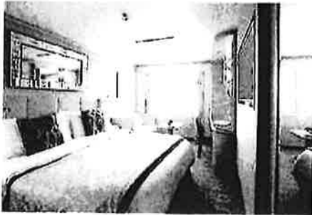
Stateroom GTY Queen Bed EDIT